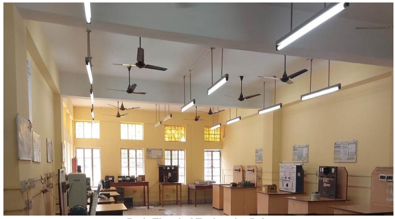
Basic Electrical Engineering Lab