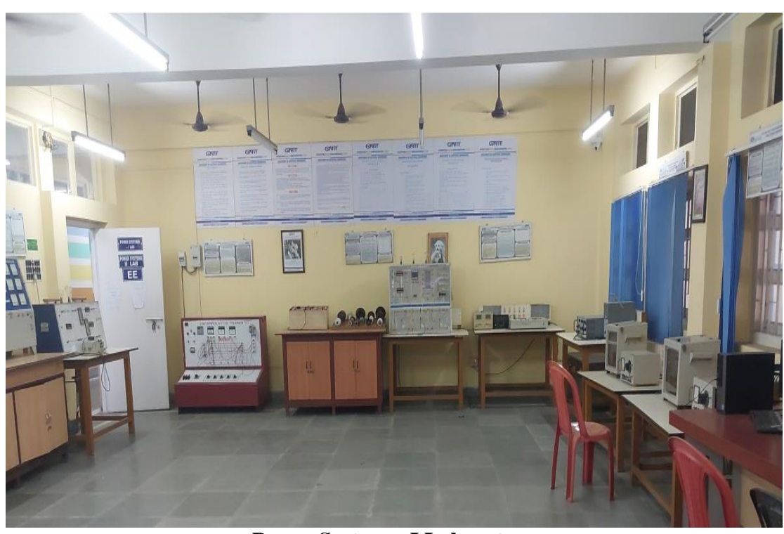
Power System – I Laboratory