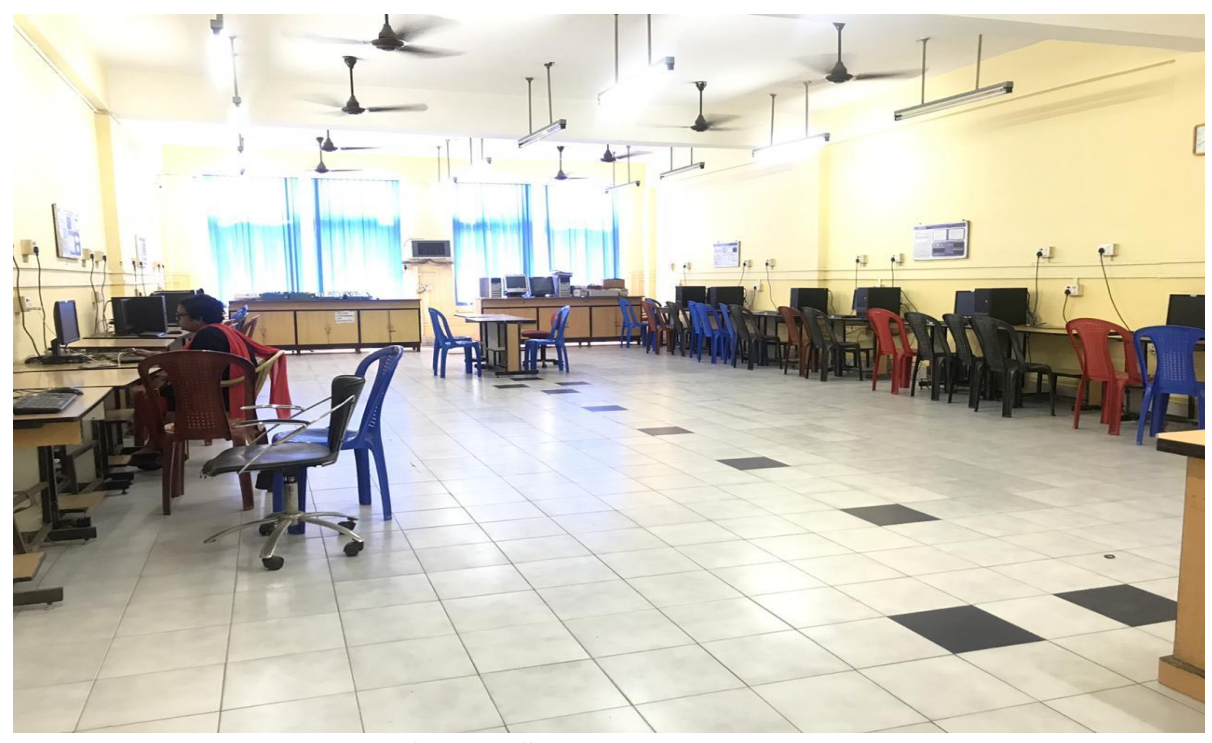
Control System-II Laboratory