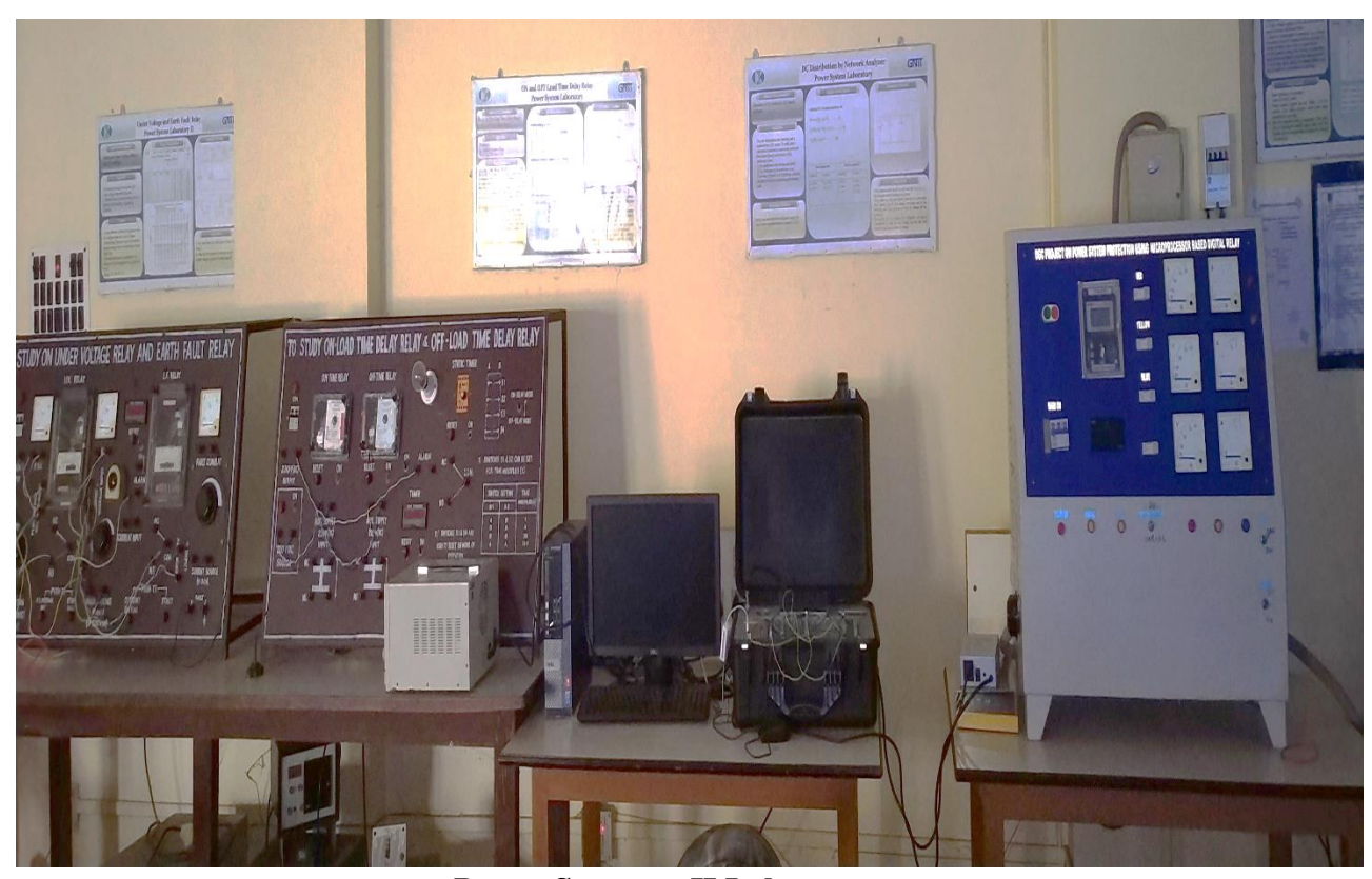
Power System – II Laboratory