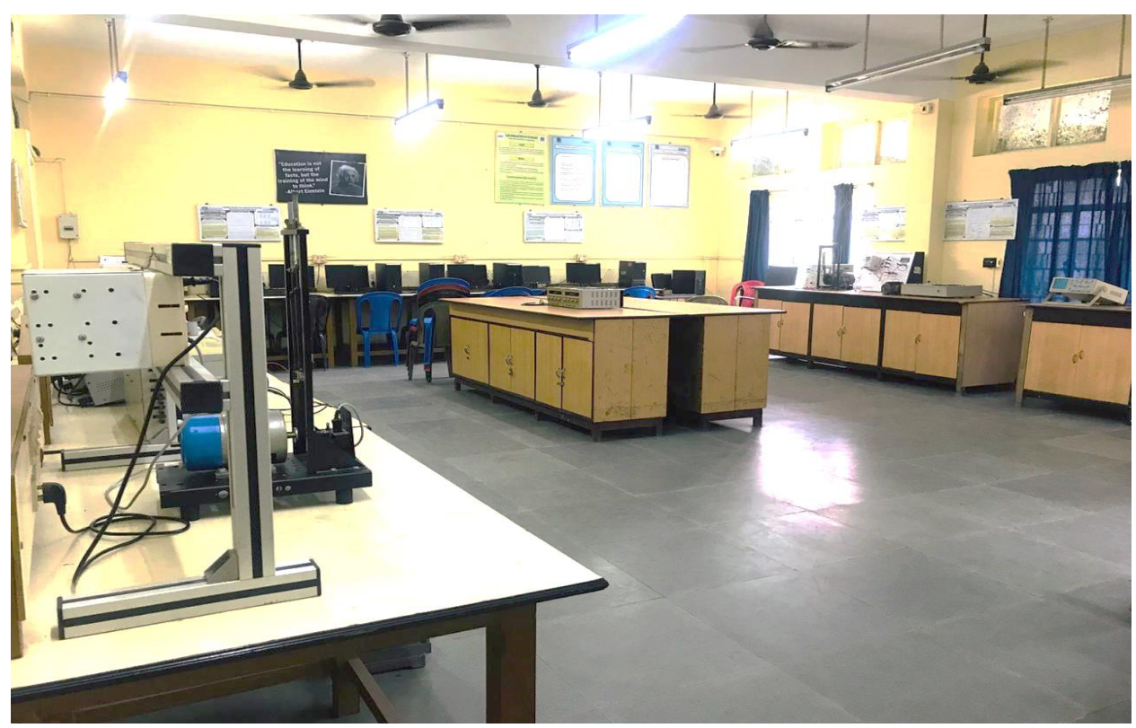
Power Electronics & Drives Lab