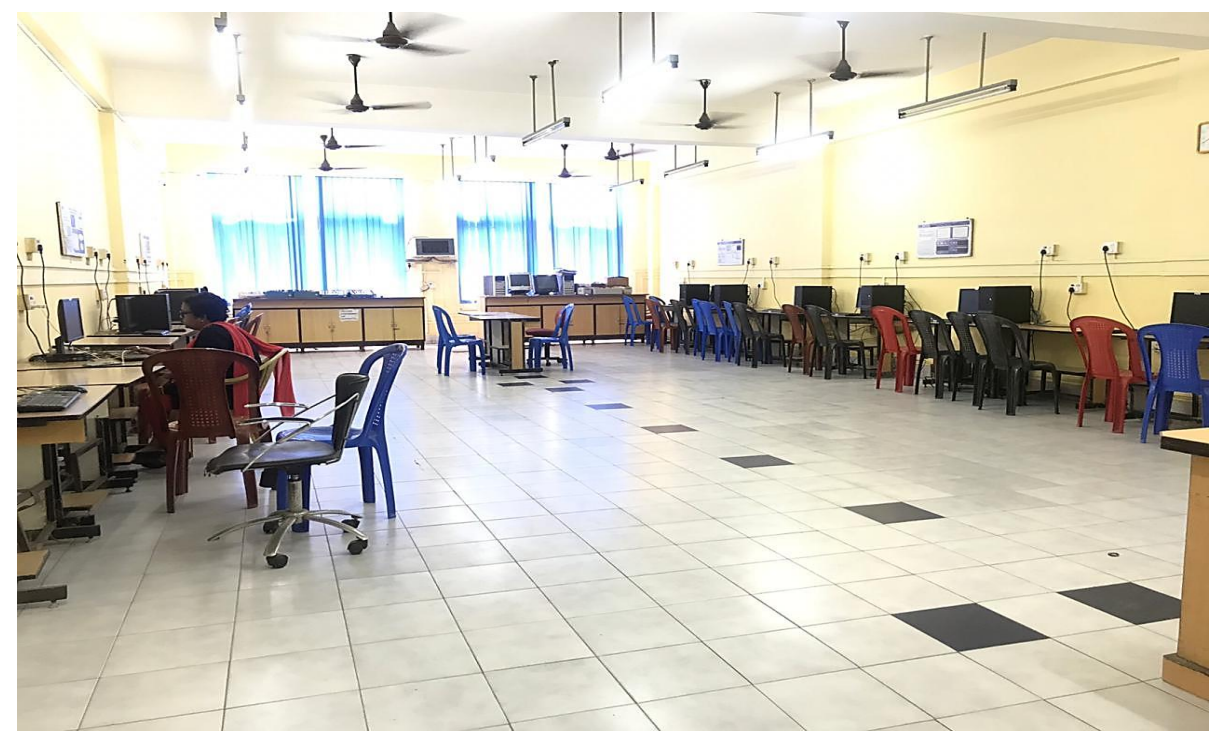
Circuit Theory Laboratory