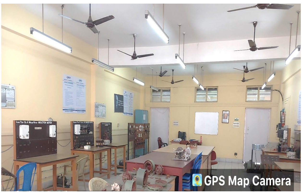
Electrical Machine-II Lab