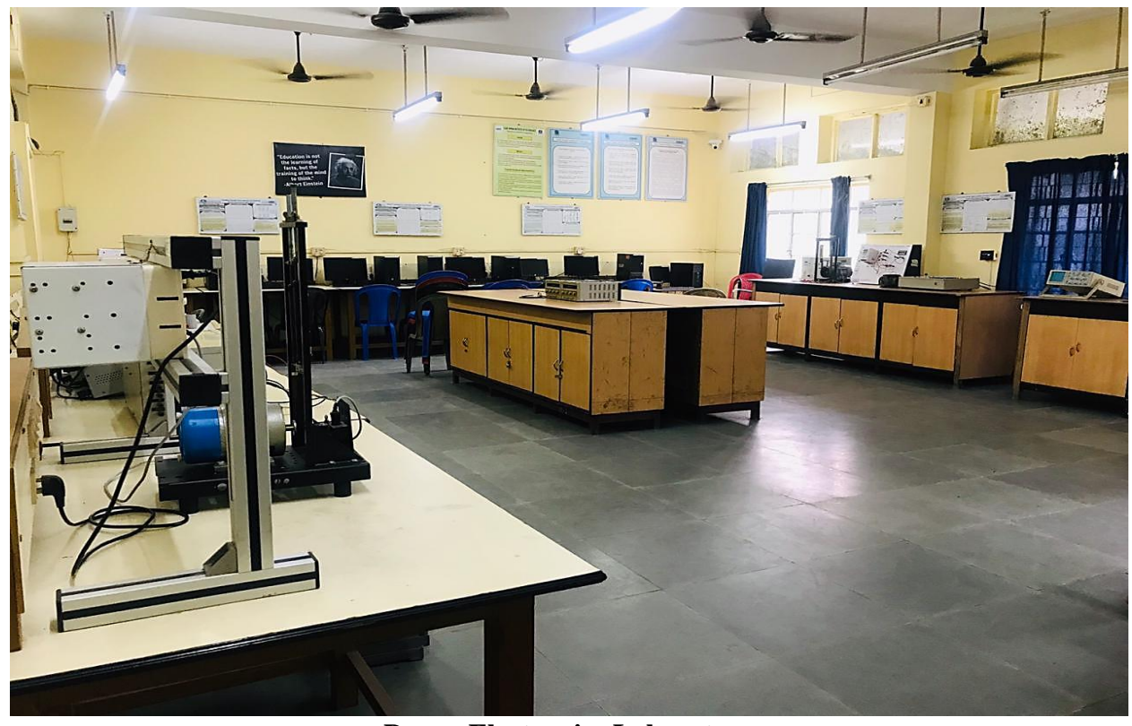
Power Electronics Laboratory